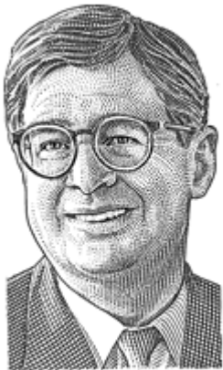
Samuel J. Palmisano

"I am convinced that the headwinds we faced as we entered this decade are now largely behind us," Mr. Palmisano said. He added that the company had improved its competitive position in its core areas of hardware, software and services. "We have transformed this company from top to bottom," he said.